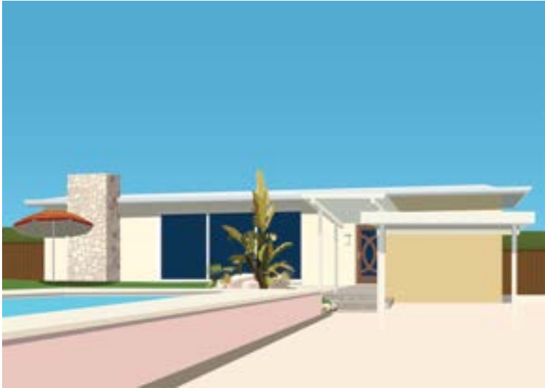
Andy McIntyre Summer Groove 2020 Digital Art Epson Archival Matte 20" x 14" $500

* please note that all works are archivally framed *