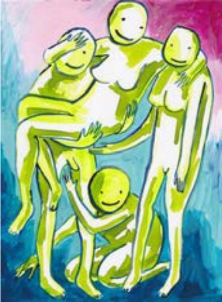
Eames Armstrong Aliens Trying Human Genitalia 2018 Mixed media 6" x 8"

* please note that all works are archivally framed *