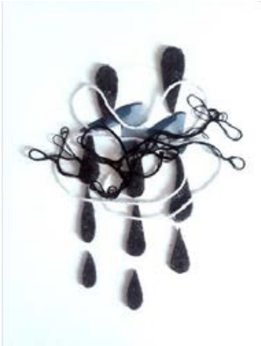
Mei Mei Chang Black Tears 2019 Mixed media 6" x 7" $200

* please note that all works are archivally framed *